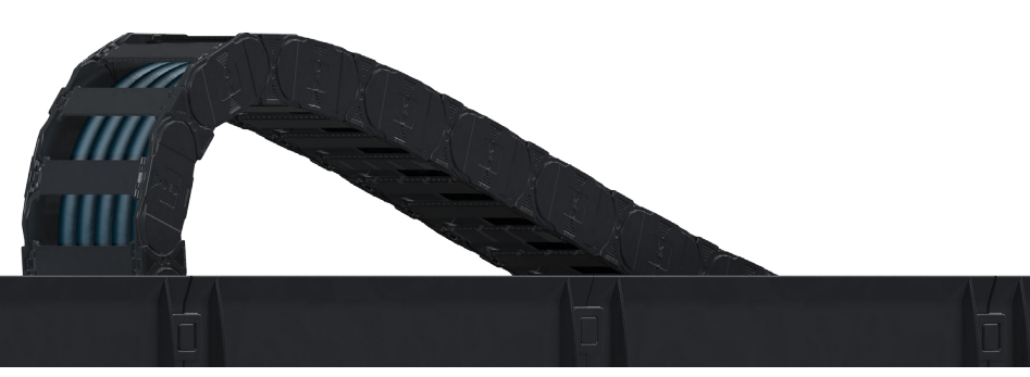
Learn more at www.igus.com/energychains

To learn more about Energy Chain<sup>®</sup> cable carrier systems or for questions about your individual application, contact igus<sup>®</sup> directly via email at sales@igus.com, or by calling 800.521.2747.